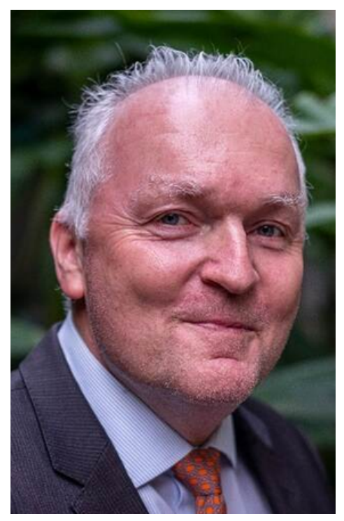
Ambassador Wiebe de Boer