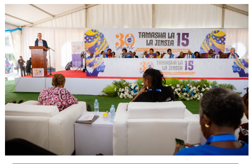
Netherlands Embassy Deputy Ambassador, Job Runhaar making a speech at the TGNP Festival 2023

The Embassy proudly sponsored the participation of five panelists, who coincidentally are beneficiaries of our project support initiatives (namely representatives from TAI Tanzania, Doors of Hope Foundation, youth from the ruling political party CCM and opposition party ACT Wazalendo); in the 2023 TGNP Gender Festival.